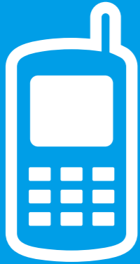
COMMUNICATIONS & TELECOM